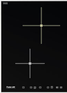
Table de cuisson Ognidove